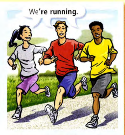
They're running. They aren't walking.