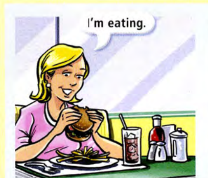
She's eating. She isn't reading.