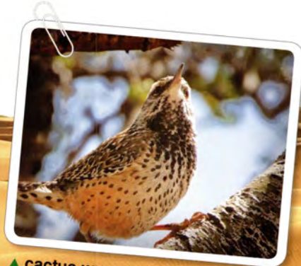
▲ cactus wren

The desert is a harsh land for plants. The soil does not have much water. It doesn't have enough nutrients 2 , either. A cactus is one of the plants that can survive 3 in the desert. It has long thin roots. And they can reach 4 water deep inside the ground.